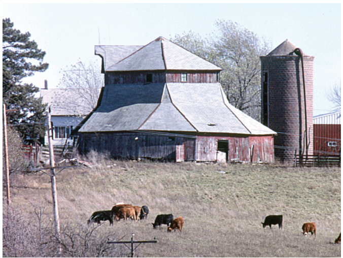
White Oak Farm 1984

It did not appear to be in use when these photos were taken in 1984, although there were cattle grazing in an adjacent field. It was listed on the National Register of Historic Places. Gone.