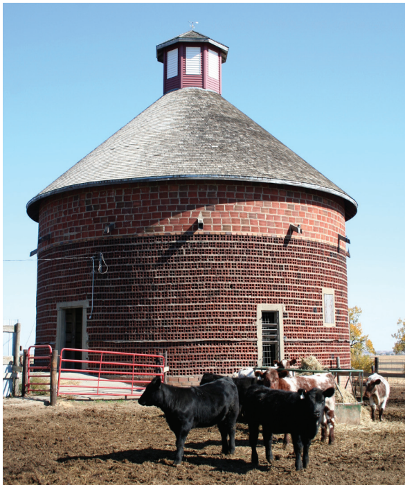
Harrison County 3322 Overton Avenue, Logan