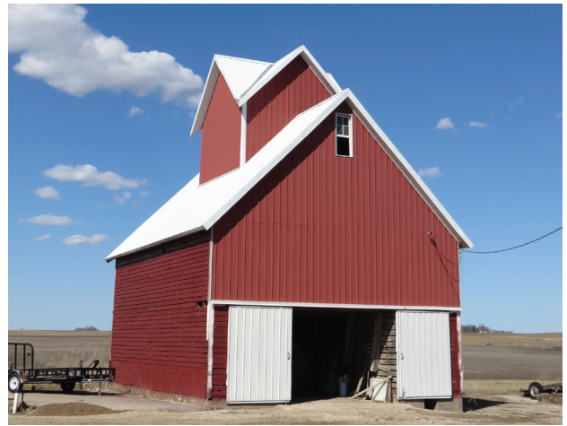
Woodbury County Whittemore Township, Section 5

A square yellow corncrib. Corn was stored on the second level as well as the third level. A bucket with a motor was used to transport the corn to the top level. It is now used for storage.